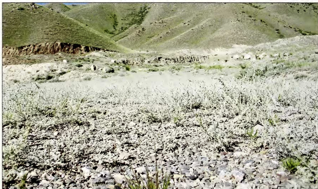
Fig. 3. Biotope where C. afghana Swinhoe, 1885 was caught: Bishkek area, locality Kok-Dzhar, 800 m, semidesert.